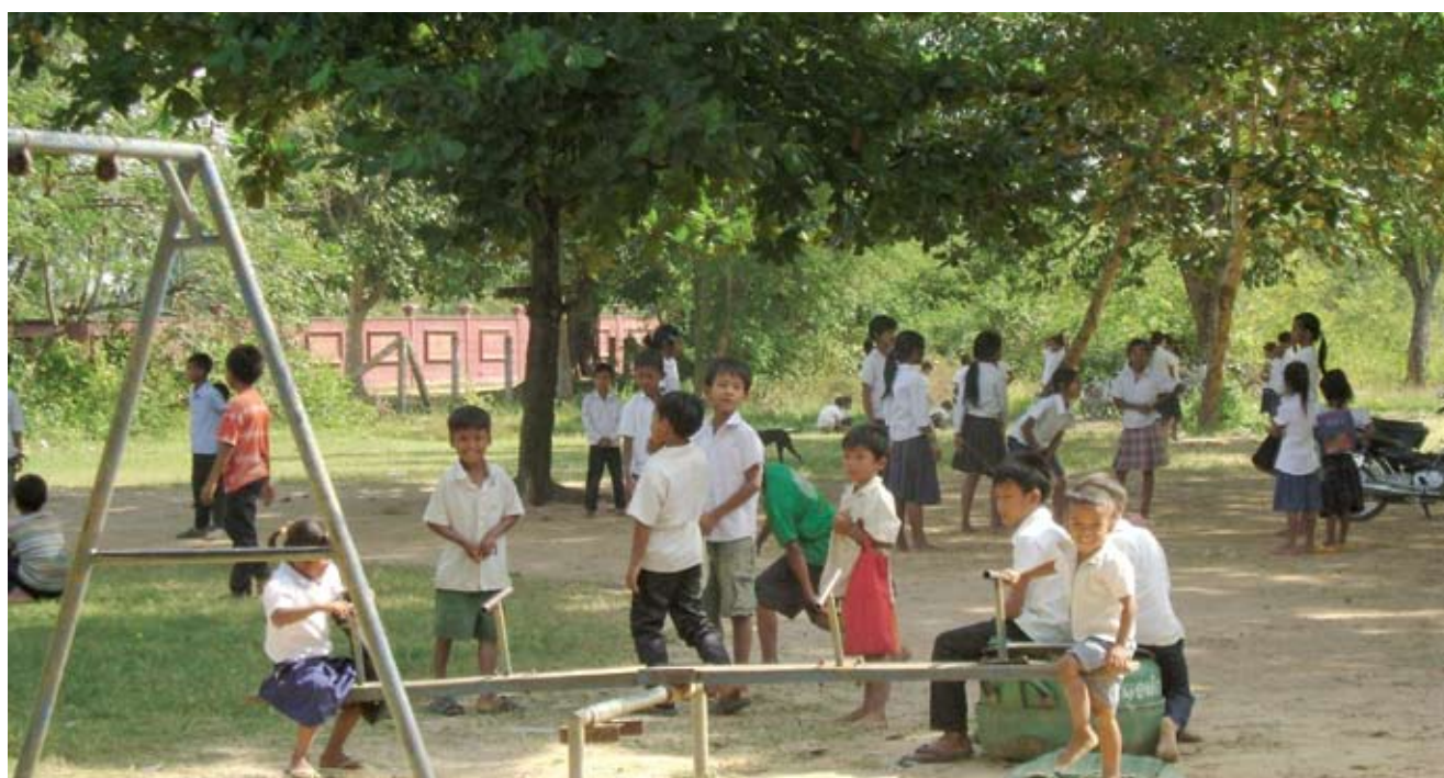
An educated population is vital to Cambodia's development; the 2007 Law on Education makes school compulsory for all children up to grade 9; a primary school in Takeo province, December 2011