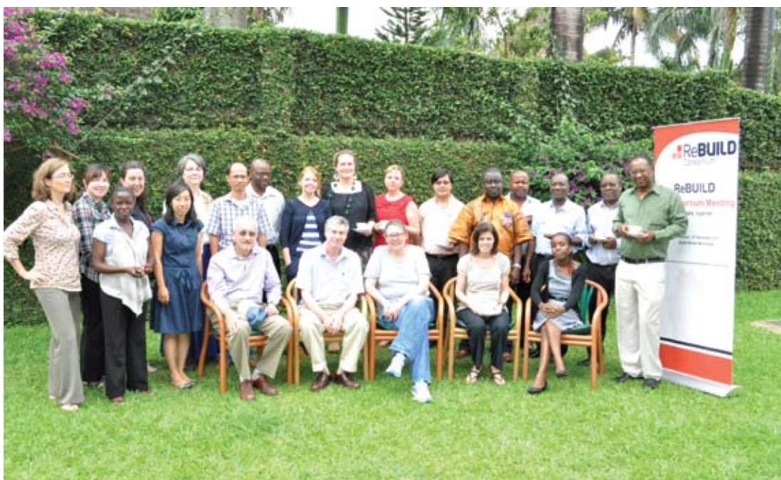
CDRI researchers attending the ReBUILD Research Programme Consortium meeting, Kampala, Uganda, November 2011

Central Institute for Economic Management (CIEM), Vietnam Faculty of Management and Economics, Kunming University of Science and Technology (KUST), Yunnan, China General Department of Statistics, National Committee for Planning and Investment (formerly National Centre of Statistics), Laos Institute of Economics (IE), Vietnam Academy of Social Sciences, Vietnam National Economic Research Institute (NERI), Laos Thailand Development Research Institute (TDRI), Thailand