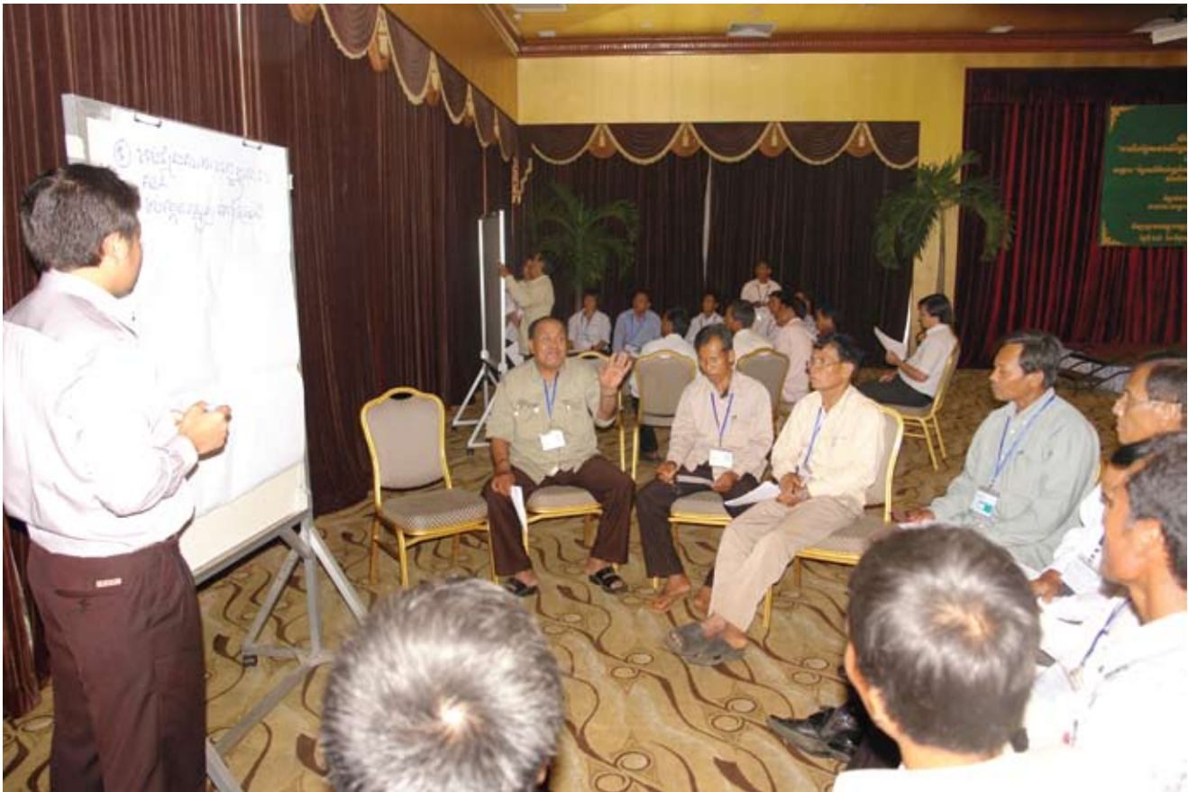
Discussion groups at the National Workshop on “Household Level Forest Reliance” organised by CDRI, Phnom Penh, June 2011