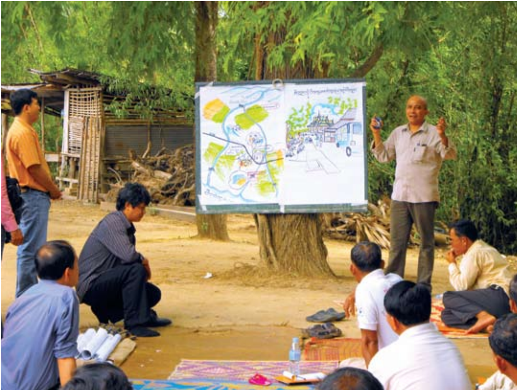
Feedback on participatory water resource mapping by a consultant for the Water Resource Management Programme, Pursat province, July 2011

National Assembly National Bank of Cambodia National Committee for Sub-national Democratic Development (NCDD) National Election Committee National Institute of Statistics National League of Communes/Sangkats Office of the Council of Ministers (OCM) Securities and Exchange Commission of Cambodia (SECC) Senate Sub-national Administration Supreme National Economic Council (SNEC)