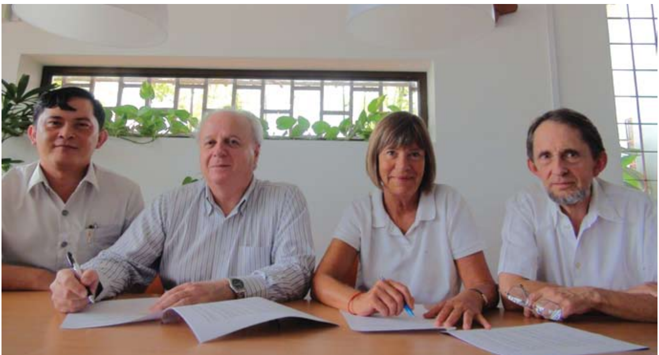
Signing of new agreement extending Sida's support for CDRI's research programme, and contribution to core operating costs, Phnom Penh, August 2011

Cambodia National Mekong Committee Cambodian Mine Action Authority (CMAA) Council for Agriculture and Rural Development (CARD) Council for the Development of Cambodia (CDC) District Councils Ministry of Agriculture, Forestry and Fisheries Ministry of Commerce Ministry of Economy and Finance Ministry of Education, Youth and Sport Ministry of Environment Ministry of Health Ministry of Interior Ministry of Labour and Vocational Training Ministry of Land Management, Urban Planning and Construction Ministry of Planning Ministry of Public Works and Transport Ministry of Rural Development Ministry of Tourism Ministry of Water Resources and Meteorology Ministry of Women's Affairs National AIDS Authority