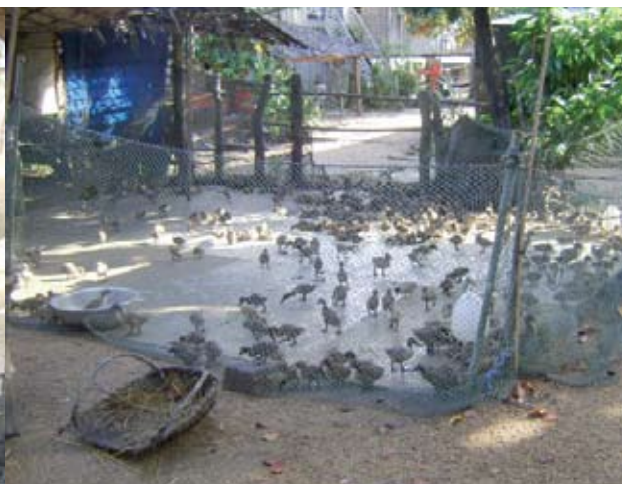
Duck raising needs small investment and no special skills to give a short term return, Kompong Chhnang province, November 2011