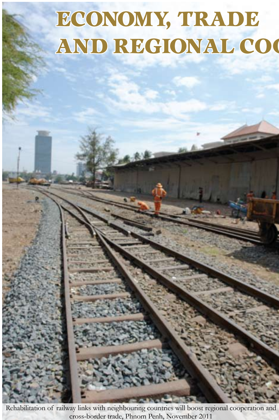
Rehabilitation of railway links with neighbouring countries will boost regional cooperation and cross-border trade, Phnom Penh, November 2011

Four studies have been completed: China's Sectoral Composition of Economic Growth, Poverty Reduction and Inequality: Development and Policy Implication for Cambodia (ADB); Foreign Investment in Agriculture in Cambodia (FAO); Different Streams, Different Needs and Impact: Managing International Labour Migration in ASEAN (IDRC); and the Development Research Forum: Phase I (IDRC).