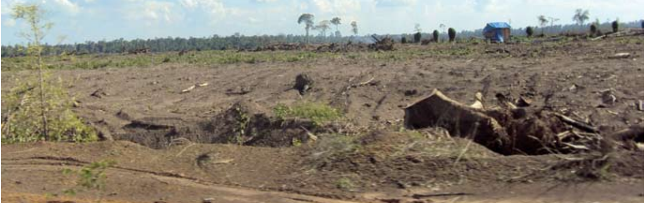
Land has been cleared in preparation for a rubber plantation, Kompong Cham province, May 2011

The NRE team completed four projects and one major research programme. Four research projects are ongoing and two more are being developed.