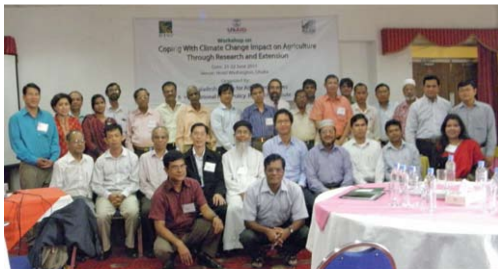
A three member team from CDRI at a workshop on “Coping with Climate Change Impacts on Agriculture through Research and Extension”, Dhaka, Bangladesh, June 2011