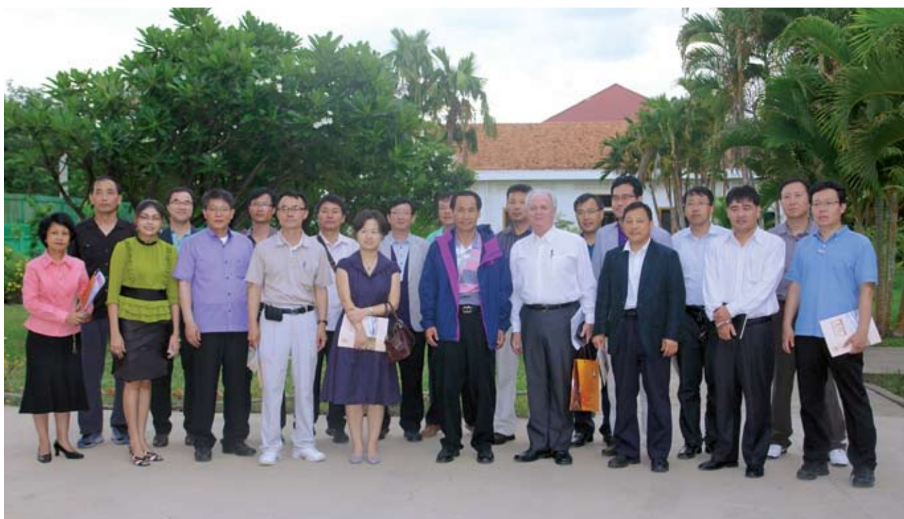
A delegation from the Ministry of Unification of the Republic of Korea visiting CDRI to learn about Cambodia’s policies and plans for economic development CDRI, June 2011