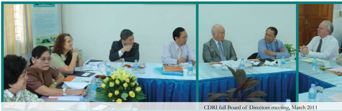
CDRI full Board of Directors meeting, March 2011

In a major milestone, on 12 August CDRI and the Swedish International Development Agency (Sida) signed an agreement for a new five year programme of Sida resource support and partnership, currently valued at USD4.2 million, from July 2011 to June 2016. The resources will support core operating costs, along with significant research and capacity development support for the Democratic Governance and Public Sector reform programme, further deepening its fine body of work on Cambodia's decentralisation and deconcentration reforms, and seeding support for new research on emerging issues of inclusive growth, climate change and education. As part of the process, in accordance with the requirements of the Swedish Audit Office, Sida commissioned KPMG to undertake an institutional review of CDRI, which confirmed the high standards of CDRI's institutional governance and management.