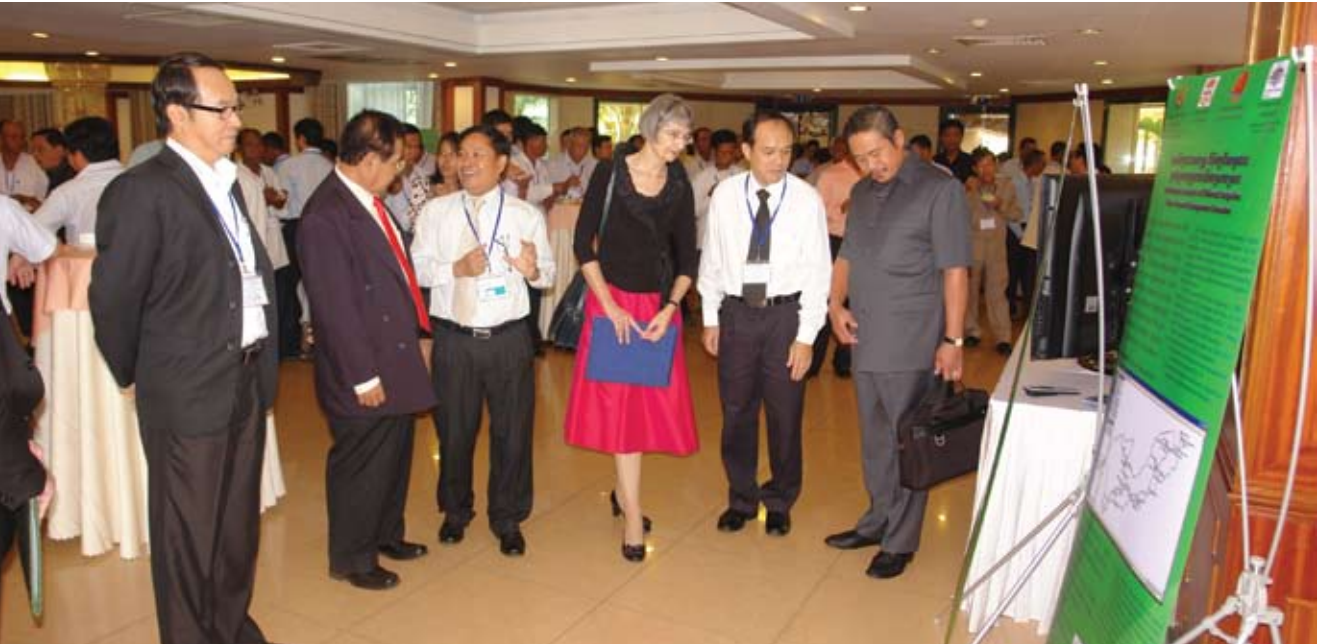
អ្នកស្រាវជ្រាវជាន់ខ្ពស់ របស់អង្គការស្រាវជ្រាវ និងអ្នកតំណាងក្រសួងធនធានទឹក និងឧតុនិយម សង្ខេបព័ត៌មានជូនឯកអគ្គរដ្ឋទូតអូស្ត្រាលី ក្នុងសិក្ខាសាលាថ្នាក់ជាតិ ចំពោះកម្មវិធីពង្រឹងសមត្ថភាពស្រាវជ្រាវ និងគ្រប់គ្រងធនធានទឹករយៈពេល ៥ឆ្នាំ ផ្តល់មូលនិធិដោយ AusAID ភ្នំពេញ ខែកក្កដា ២០១១ Senior CDRI researchers and MoWRAM representative brief Australian Ambassador at the final National Workshop of the five-year AusAID funded Water Resource Management Research Capacity Development Programme, Phnom Penh, July 2011