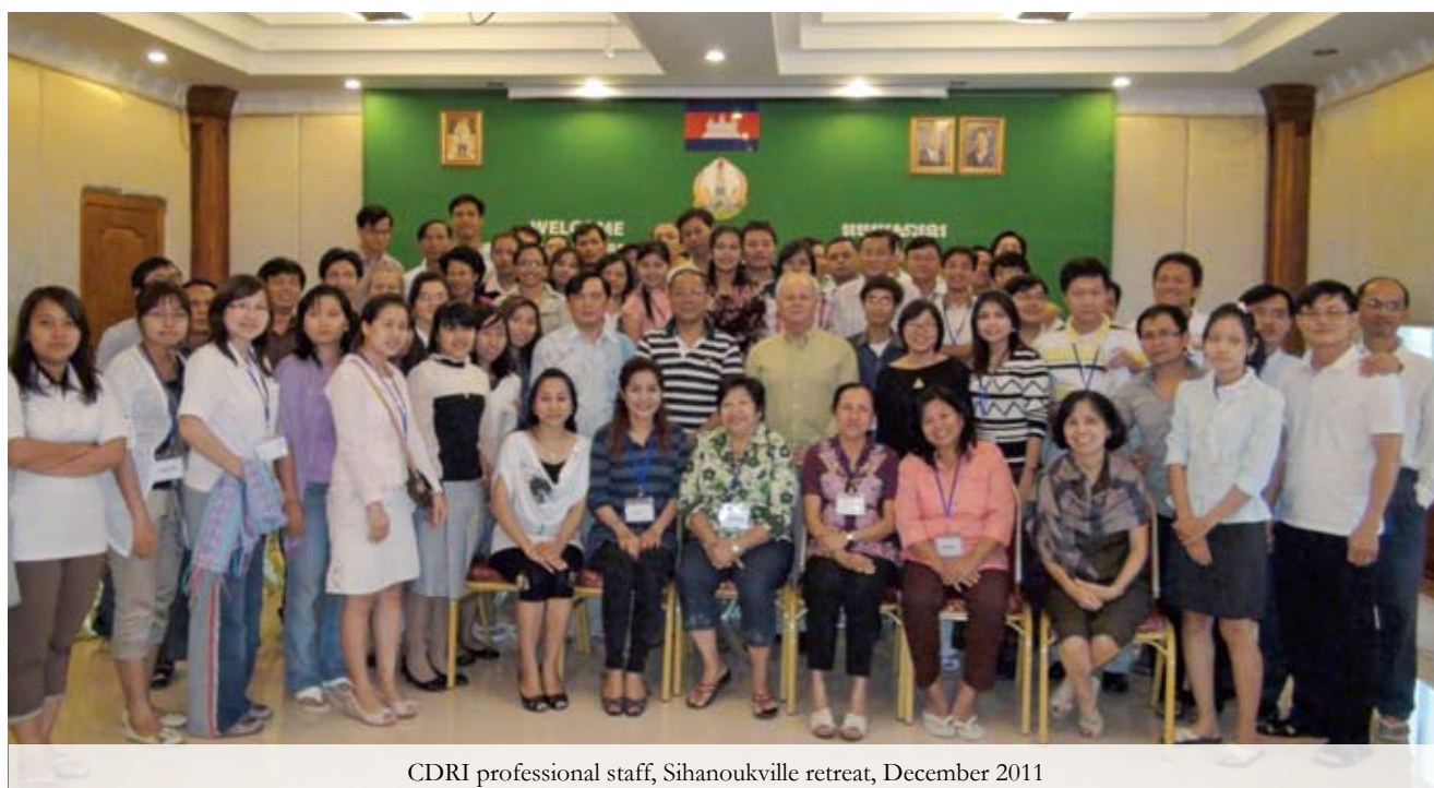
CDRI professional staff, Sihanoukville retreat, December 2011

These five themes are reflected in CDRI's research management structure. CDRI's research is multi-disciplinary. Its Cambodia 2020 Research Strategy emphasises cross-programme collaboration on the major cross-cutting issues of sustainability, poverty reduction, governance and institutional arrangements, gender equity, and conflict prevention and resolution.