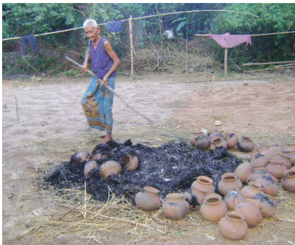
Tending the firing of traditionally made clay pots, this experienced potter now helps her daughter run the business, Kompong Chhnang province, November 2011