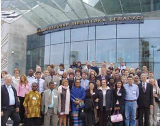
បុគ្គលិកបណ្តាលយើងទៅចូលរួមសន្និសីទ ព័ត៌មានអេឡិចត្រូនិកសម្រាប់ បណ្តាលយ ក្រុងមីញ៉ក់ បេឡារុស មិថុនា ២០១១ A CDRI librarian joins the General Assembly of Electronic Information for Libraries, Minsk, Belarus, June 2011

វគ្គបណ្តុះបណ្តាលនៅក្នុង វបសអ ស្តីពី ការ កសាង និងគ្រប់គ្រងគម្រោងស្រាវជ្រាវ បានចប់សព្វគ្រប់ ទាំងបួនម៉ឺនីល នៅខែកញ្ញា ឆ្នាំ២០១១ ហើយការបង្កើត ជា សៀវភៅកូនខ្នាតសម្រាប់ការបណ្តុះបណ្តាល កំពុង