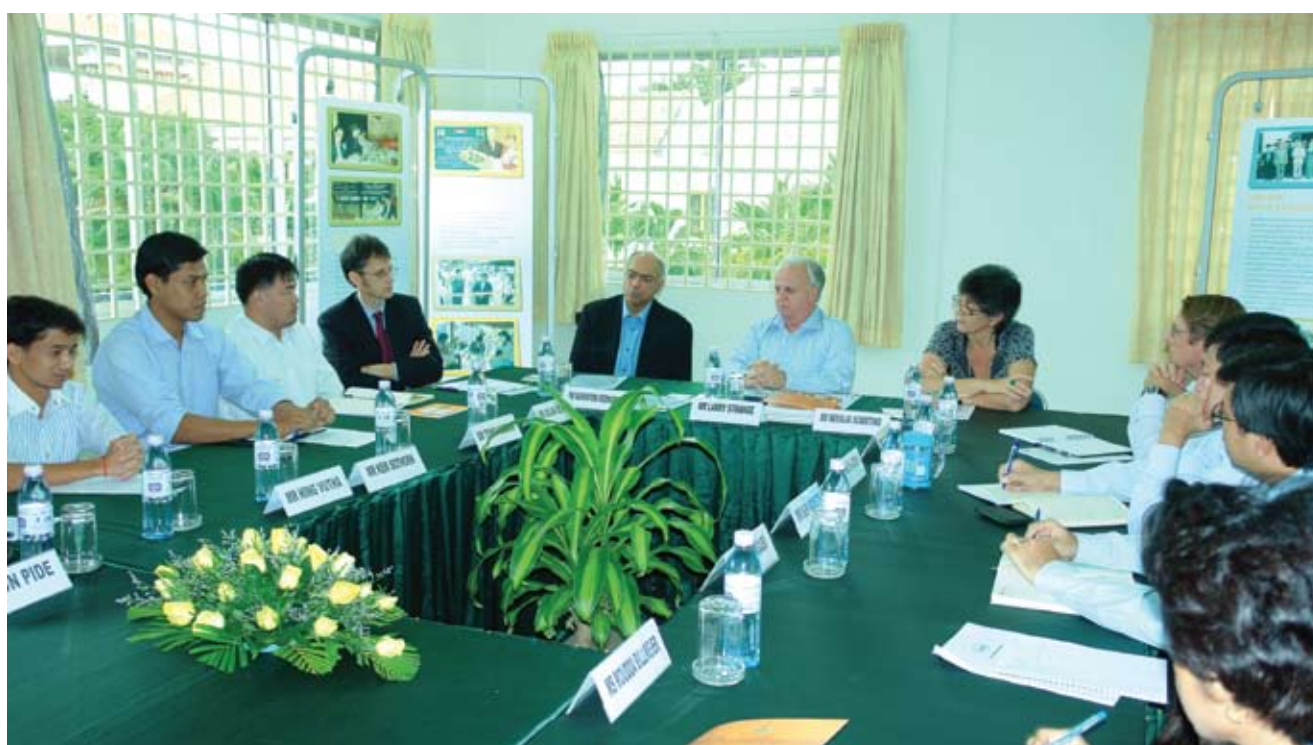
Roundtable discussion on socio-economic development issues in Cambodia and the Greater Mekong Sub-region between CDRI researchers and delegates from the International Development Research Center, CDRI, December 2011