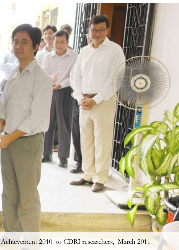
Achievement 2010 to CDRI researchers, March 2011