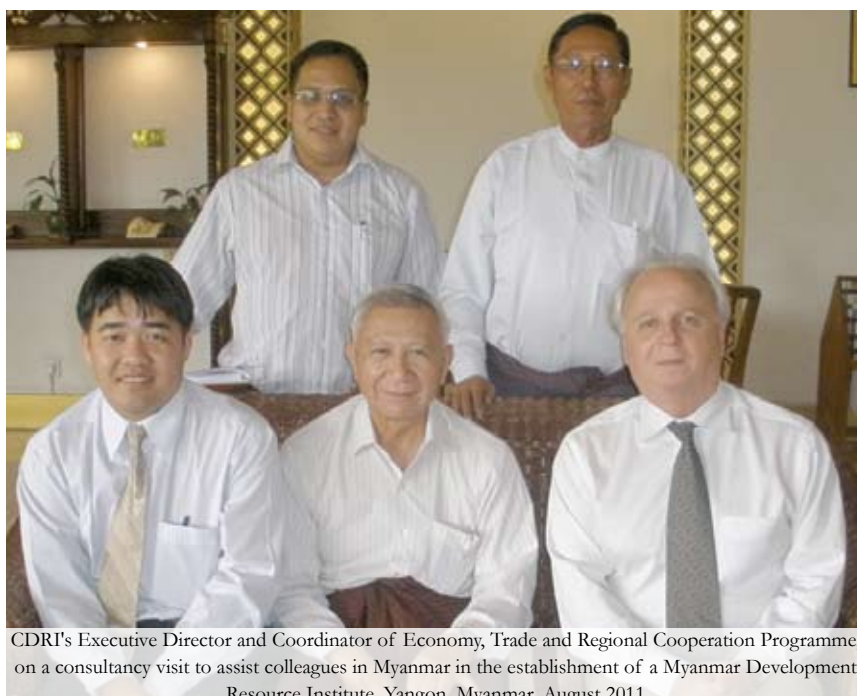
CDRI's Executive Director and Coordinator of Economy, Trade and Regional Cooperation Programme, on a consultancy visit to assist colleagues in Myanmar in the establishment of a Myanmar Development Resource Institute, Yangon, Myanmar, August 2011

CDRI was commissioned by IDRC to assess the establishment of an independent development policy research institute in Myanmar on the CDRI model. This was in response to a request from some of the stakeholders in MDRI following a visit to CDRI in late 2010.