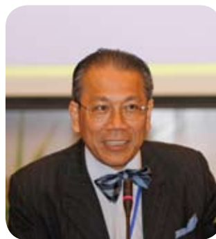
CDRI's New Board Chair