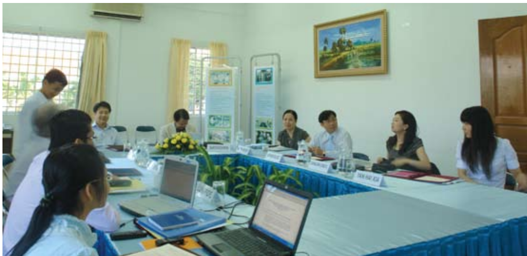
Greater Mekong Sub-region Development Analysis Network (GMS- DAN) 2011 Workshop: DAN 8 - Lesson Learnt, Review and Follow up, CDRI, July 2011