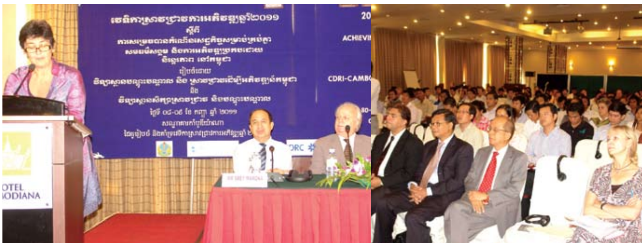
វេទិកាស្រាវជ្រាវការអភិវឌ្ឍឆ្នាំ២០១១ ស្តីពីការសម្រេចបានកំណើនសេដ្ឋកិច្ចសម្រាប់គ្រប់គ្នា សមធម៌សង្គម និងការអភិវឌ្ឍប្រកបដោយនិរន្តរភាពនៅកម្ពុជា ភ្នំពេញ ខែកញ្ញា ឆ្នាំ២០១១ 2011 Development Research Forum Symposium on "Achieving Inclusive Growth, Social Equity And Sustainable Development for Cambodia", Phnom Penh, September 2011

របស់អ បានបង្ហើយឯកសារសាវតារប្រទេសកម្ពុជា ដែលពាក់ព័ន្ធនឹងក្រោមកិច្ចសន្យាជាមួយ វិទ្យាស្ថាន ធនាគារអភិវឌ្ឍន៍អាស៊ី (ADB) សម្រាប់ការស្រាវជ្រាវចម្បង ថ្មីមួយរបស់ ADBI ស្តីពី "អាស៊ាន ២០៣០៖ ការរីកចម្រើន ទាំងអស់គ្នាដើម្បីវិបុលភាពរួម"។ លទ្ធផលនៃគម្រោងនេះ នឹងចាប់ផ្តើមផ្សព្វផ្សាយក្នុងឆ្នាំ២០១២ នៅកម្ពុជា នៅពេលដែល កម្ពុជា ធ្វើជាប្រធានអាស៊ាន។