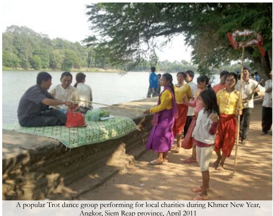
A popular Trot dance group performing for local charities during Khmer New Year, Angkor, Siem Reap province, April 2011

Funded by the Korea Development Institute (KDI), the SME Supported Bank project is in progress; the interim report was presented in Phnom Penh in August, and the second draft report was presented in Seoul, South Korea, in October. The findings of this project will be synthesised with those of the SME Support Policy project, conducted by the ETRC programme, and published as a working paper. Finally, the inception report for the Study on the Value of the Arbitration Council Service , funded by the World Bank through the Arbitration Council Foundation, has been submitted and primary field data will be collected in January/February 2012.