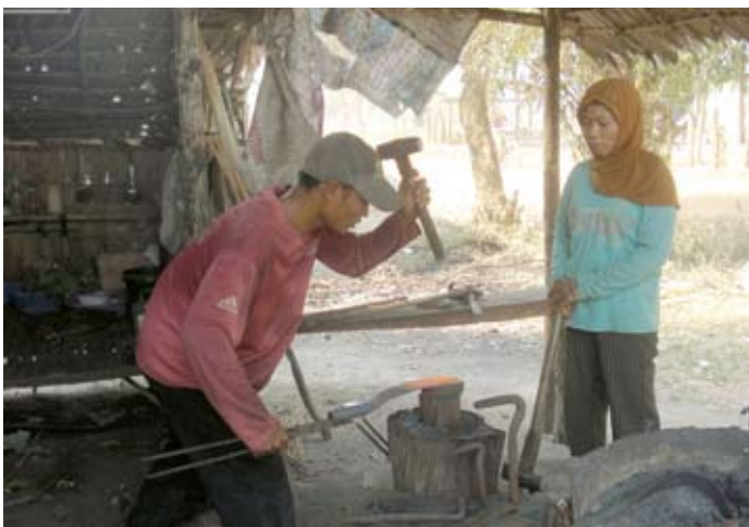
Traditional activities co-exist with modern industry to offer the most suitable tools for village workers, Pursat province, February 2011

A proposal on Building and Strengthening a Sustainable GMS-DAN 2011-14: Collaborative Policy Relevant Research on Inclusive Growth and Sub-regional Integration in the GMS has been approved by the Rockefeller Foundation and is currently being reviewed by the International Development Research Center for final approval. Two manuscripts, each a compilation of GMS-DAN country studies, are being prepared for international publication by ISEAS: Costs and Benefits of Cross-country Labour Migration in the GMS (GMS-DAN Series 1) , and Assessing China's Impact on Poverty in the Greater Mekong Sub-region (GMS-DAN Series 2) . A further two manuscripts - Surviving the Global Financial and Economic Downturn: The Cambodian Experience , and Land Policy and Practice in Cambodia have also been submitted to ISEAS for international publication and release.