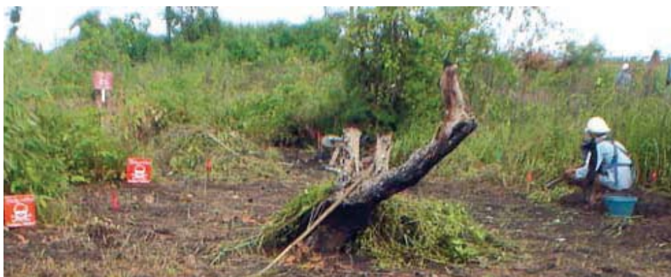
It is much more costly to remove land mines than it was to lay them but demining is essential for rural people to enjoy life without fear of being maimed or killed by UXO: A CMAC demining team in action

Recovery from Conflict “ReBUILD” has been concluded. Funded by DFID-UK and co-led by the Liverpool School of Tropical Medicine and Queen Margaret University, UK, the project aims to produce high quality evidence that contributes to improving the health of the poorest in developing countries. Other partner institutions include Makerere University, Uganda; College of Medicine and Allied Health Sciences, Sierra Leone; and the Biomedical Research and Training Institute, Zimbabwe. The Cambodia team has developed three research protocols: (1) The Impact of Health Financing Policy Change on Patterns of Poor Rural Household Expenditure for Health Care in Cambodia: An Analysis of Households’ Health Expenditure; (2) Policies to Attract and Retain Health Workers in Rural Areas: A Review of Policy Drivers, Implementation and Effectiveness in Post-conflict Cambodia; and (3) Contracting Model and Performance Management in Cambodia. The inception