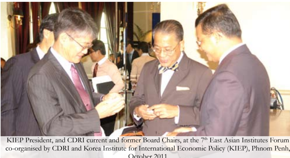
KIEP President, and CDRI current and former Board Chairs, at the 7 th East Asian Institutes Forum co-organised by CDRI and Korea Institute for International Economic Policy (KIEP), Phnom Penh, October 2011

CDRI is now part of an international research consortium, led by the Liverpool School of Tropical Medicine, awarded a six year health research programme funded by DFID for Research for Building Pro-poor Health