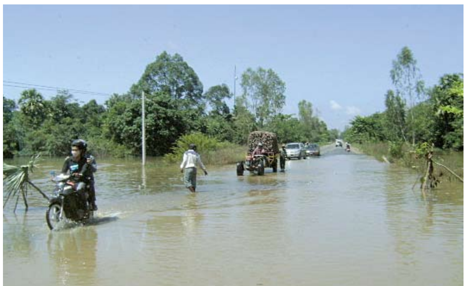
The big flood in 2011 disrupted many economic activities, National Road 5, Pursat province, November 2011

The inception year of the six-year research programme consortium on Building Pro-poor Health Systems during