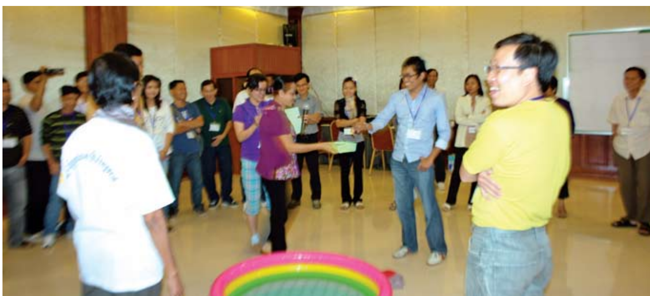
Team building exercise at the CDRI 2011 Staff Retreat in Sihanoukville, December 2011