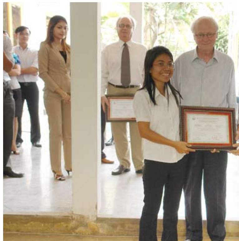
Board Director presenting the CDRI Award for Outstanding Research

CDRI achieved a sound financial result in 2011, with an operating budget of USD2,454,948. Finance management continued to maintain a high standard of accountability and transparency and strengthen financial services and systems, improving the structure and services to generate more information and diverse reports for all units and programmes.