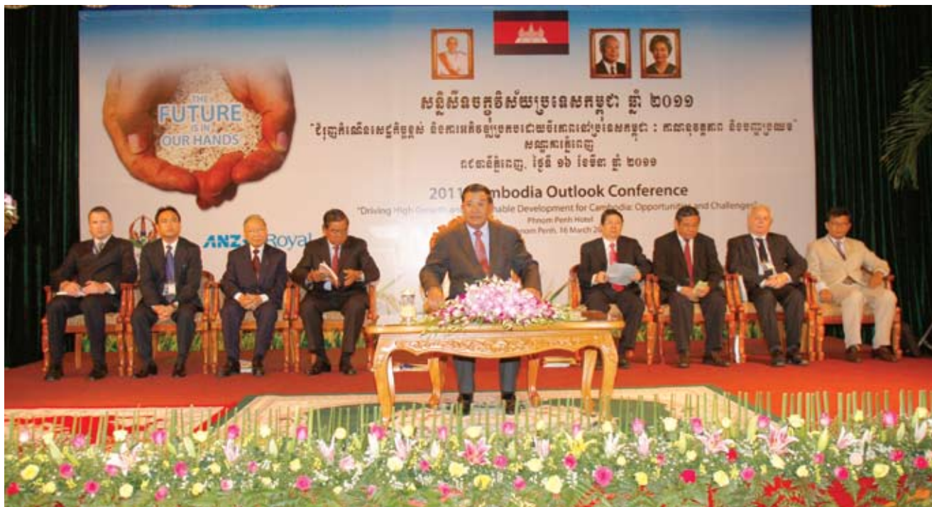
Prime Minister Hun Sen presiding over the opening ceremony of the 2011 Cambodia Outlook Conference, Phnom Penh, March 2011