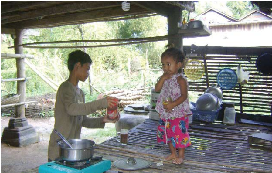
In rural areas water storage is as important as the source because many families still drink un-boiled water, Kompong Chhnang province, November 2011

The first draft report on Promoting Gender Equality in the Labour Market for More Inclusive Growth , an ADB-funded project, was submitted and is being finalised based on ADB's comments. The project outcomes are expected to expand decent employment opportunities for women and contribute to the design of ADB's labour market support programme in Asia. Research findings have been drawn upon for an article published in the ADR 2011/12.