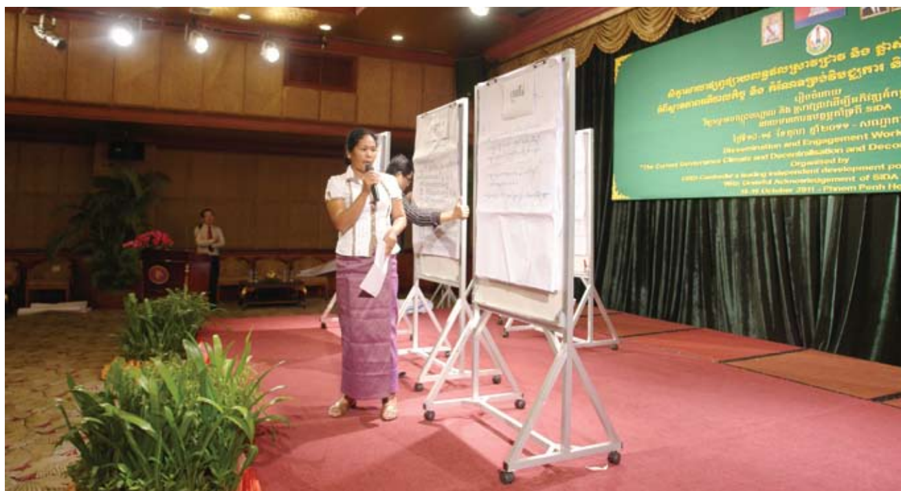
Commune councillor's reports group discussion in dissemination workshop on “The Current Governance Climate and D&D Reform” hosted by CDRI in Phnom Penh, October 2011