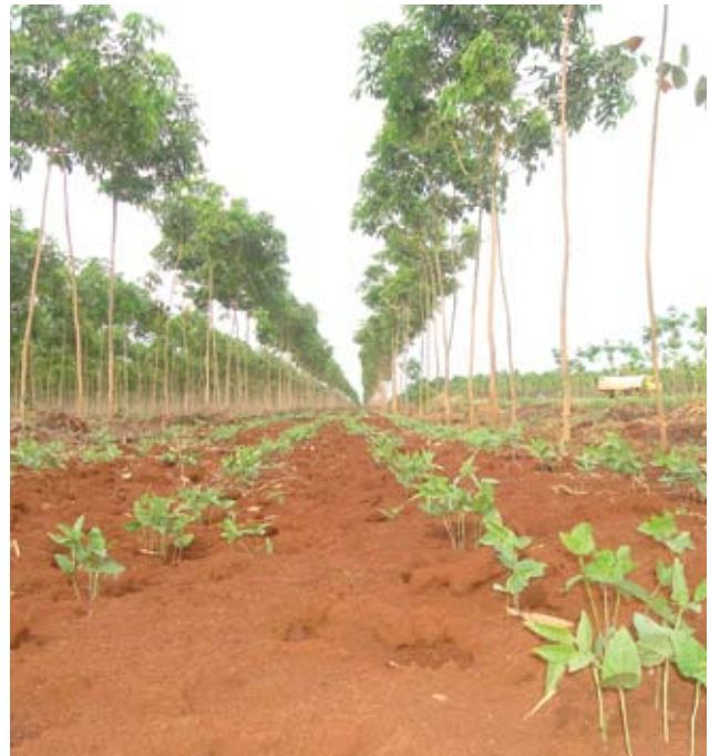
Intercropping with annual and perennial crops for cash or subsistence helps smallholder rubber farmers bridge the income gap until trees mature for tapping 5-6 years after planting, Kompong Cham province, May 2011

on rural people's dependency on water resources along a 15 km corridor of the Mekong River. The report is being finalised based on comments from the national workshop conducted in Siem Reap in November. The study on Climate Change Impact and Resilience: A Case of Irrigation, Land Use, Rainfall Changes and Water Governance is ongoing. A joint project between CDRI and RUPP, it focuses on food security, livelihood improvement and hydrology. The work plan has been finalised for the project Strengthening Aquatic Resources Governance (STARAGO) , funded by the WorldFish Center to examine the resolution of fisheries resources conflict around the Tonle Sap Lake. The work plan has been drafted for Climate Change, Adaptation and Livelihoods for Inclusive Growth , a five year Sida-funded project, which will explore climate change impacts and local people's ability to adapt to those impacts across main agro-ecosystems, and look at how to improve existing agricultural practices in relation to climate change adaptation.