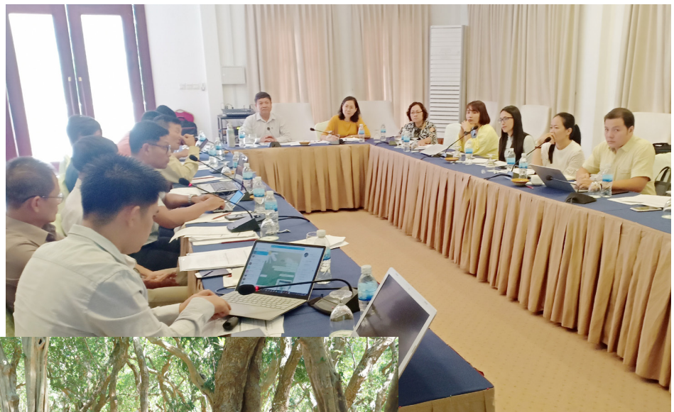
CDRI staff retreat, Siem Reap, November 2019

* Indicates departure in October 2019 to February 2020 from CDRI