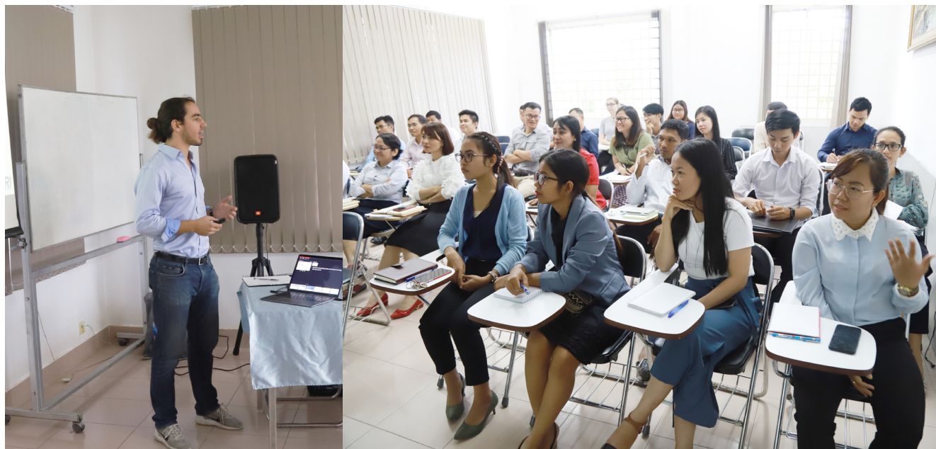
កម្ពុជាប្រឹងប្រែងជាខ្លាំងក្នុងការពង្រឹងអភិបាលកិច្ចផ្នែកសន្តិសុខអ៊ិនធើណិត ដើម្បីទាញយកចំណេញពីអត្ថប្រយោជន៍រំពឹងទុក និងកាត់បន្ថយគ្រោះថ្នាក់អាចកើតចេញពីការតភ្ជាប់កាន់តែច្រើនឡើងក្នុងពិភពលោក, សិក្ខាសាលានៅ CDRI ខែតុលា ២០១៩ Cambodia is working hard to strengthen its cybersecurity governance to take advantage of the expected benefits and minimise the potential risks from an increasingly interconnected world, seminar at CDRI, October 2019

ក្នុងការបោះពុម្ពផ្សាយនេះ CDRI អាចគ្រប់គ្រងបានពេញលេញលើការងារ កែសម្រួលអត្ថបទ បកប្រែឯកសារកំណត់ទម្រង់អត្ថបទ រចនារៀបចំឯកសារ និងផ្សព្វផ្សាយផលិតផលស្រាវជ្រាវ ពោលគឺ អាចចេញផ្សាយបានក្នុង