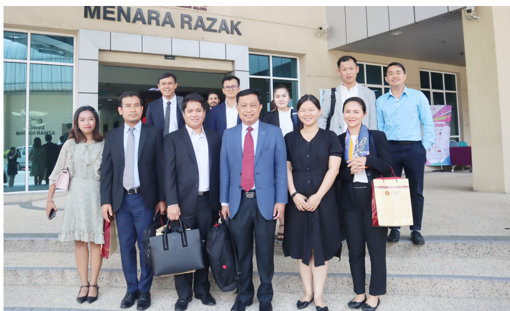
Cambodian delegation led by CDRI on an education and exposure trip to Malaysia and Singapore, Johor Bahru, October 2019

CDRI generated revenue of USD1.94 million and incurred expenditure of USD2.15 million. With funds amounting to USD0.86 million carried forward from 2018, we can amply cover planned research and annual operating costs. Internal financial procedures and controls have