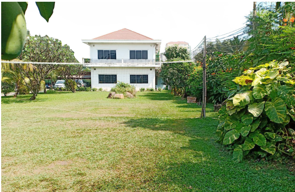
សួនច្បារ វិទ្យាស្ថាន វបសអ មករា ២០២០