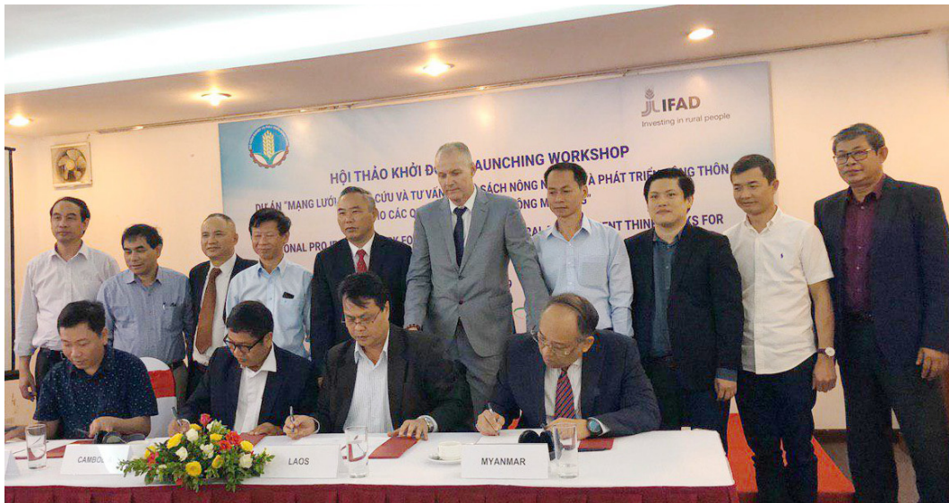
ការចុះហត្ថលេខាលើកិច្ចព្រមព្រៀងសហប្រតិបត្តិការកសាងបណ្តាញក្នុងតំបន់នៃក្រុមផ្តល់គំនិតផ្នែកកសិកម្មនិងអភិវឌ្ឍន៍ជនបទ (NARDT)៖ ហត្ថលេខីជាអ្នកតំណាងមកពី មូលនិធិអន្តរជាតិសម្រាប់ការអភិវឌ្ឍកសិកម្ម និងសមាជិកស្ថានីកនៃបណ្តាញរួមមាន កម្ពុជា ឡាវ មីយ៉ាន់ម៉ា វៀតណាម, ក្រុងហាណូយ ខែឧសភា ២០១៩ The signing of a cooperation agreement to develop a regional network for agriculture and rural development thinktanks (NARDT): signatories included representatives from the International Fund for Agricultural Development and founding members of NARDT from Cambodia, Laos, Myanmar and Vietnam, Hanoi, May 2019

វេទិកា PPP ជាចំណែកមួយនៃកម្មវិធីស្រាវជ្រាវរយៈពេលបីឆ្នាំស្តីពី ការអប់រំបណ្តុះបណ្តាលបច្ចេកទេស និងវិជ្ជាជីវៈ (TVET) និងផ្តល់មូលនិធិដោយ ទីភ្នាក់ងារស្វ័យសម្រាប់ការអភិវឌ្ឍន៍សហប្រតិបត្តិការ (SDC) ដើម្បីកសាងយន្តការមានការសម្របសម្រួលល្អមួយ សម្រាប់ឲ្យអ្នកពាក់ព័ន្ធនានាចូលរួមក្នុង TVET នៅកម្ពុជា។ វេទិកាលើកទី២ នេះ ក្រោមប្រធានបទ "ការធ្វើពាណិជ្ជកម្មលើការស្រាវជ្រាវ និងនវានុវត្តន៍នៅកម្ពុជា" បានប្រព្រឹត្តទៅនៅថ្ងៃទី៤ តុលា ក្រោមអធិបតីភាពរបស់ ឯកឧត្តម ពេជ សោភ័ន រដ្ឋលេខាធិការប្រចាំការ នៃក្រសួងការងារនិងបណ្តុះបណ្តាលវិជ្ជាជីវៈ ដោយបានអញ្ជើញមកជួបជុំគ្នាអ្នកតំណាងថ្នាក់ខ្ពស់ប្រមាណ ១០០នាក់ មកពីបណ្តា វិទ្យាស្ថានបណ្តុះបណ្តាល (ក្នុងនោះមាន ២៨វិទ្យាស្ថាននៅតាមខេត្ត) សាកលវិទ្យាល័យ សហគ្រាសឯកជន ក្រសួងនិងដៃគូអភិវឌ្ឍន៍។ វេទិកានេះផ្តល់នូវលំហូរសេសសម្រាប់ការផ្លាស់ប្តូរគំនិតយល់ឃើញ រវាងថ្នាក់ក្រោមជាតិនឹងថ្នាក់ជាតិ