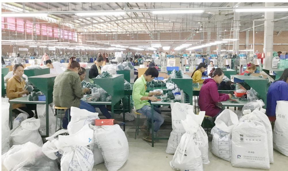
A diversification from garments: commercial production of decorative lights in Svay Rieng, July 2019