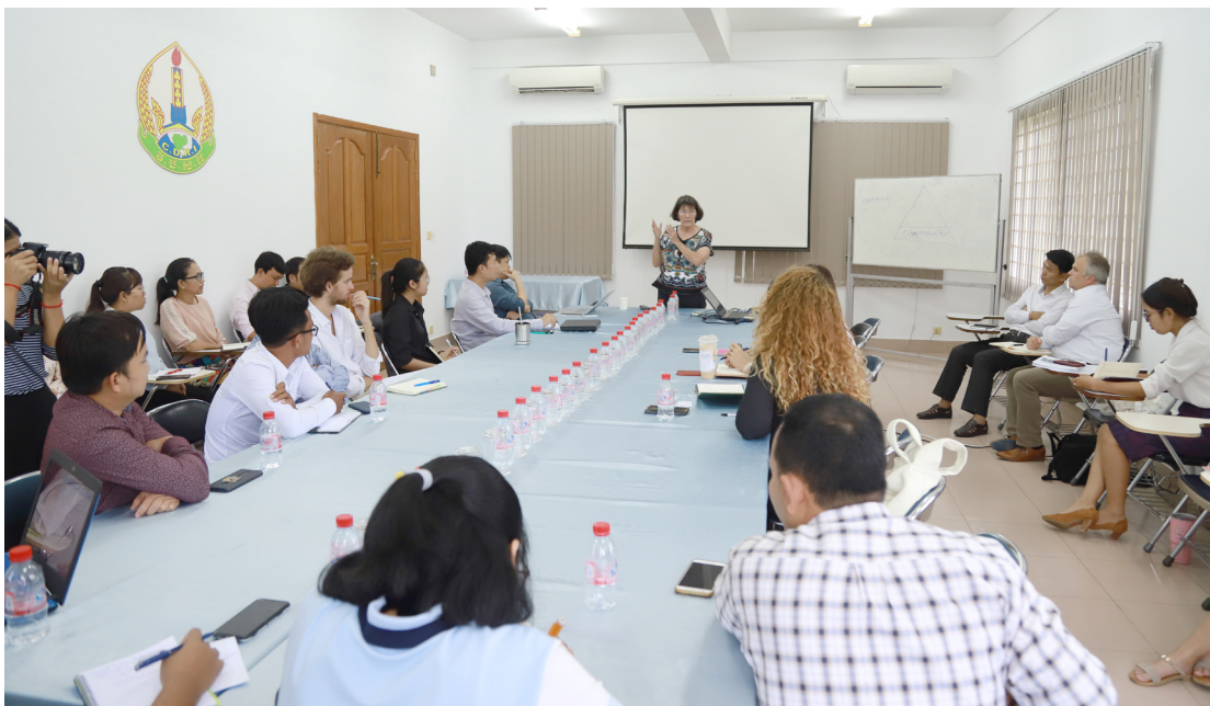
A guest speaker from Stimson Center's Southeast Asia and Energy, Water, and Sustainability program presenting her research on sustainable infrastructure and energy in Southeast Asia, with a focus on the huge potential and cost-effectiveness of solar energy in Cambodia, research seminar at CDRI, October 2019

Financial Management. CDRI's financial performance is sound. With the updated Finance Manual and closer cooperation with research units, especially the continued assistance in project proposal and budget planning, cost estimates for research projects are more accurate and disbursement and payment claims from resource partners are readily justifiable. Also with assistance from the Finance team, better recording of expenditures across all units has helped improve compliance with project implementation schedules and progress reporting. The work with the accounting firm Ernst & Young (Cambodia) Ltd. went smoothly. Their auditors have contributed many ideas to facilitate our financial management and reporting. The Finance unit is now in a better position to advise the senior management team about financial possibilities or constraints at any given time. Another development is a new directive from the government on payroll tax which requires that salaries be paid to employees fortnightly.