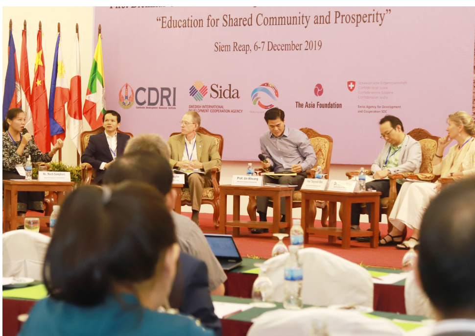
Panel discussion at the 1st Biennial Conference of the Comparative Education Society of Cambodia (CESCam), Siem Reap, December 2019

Agriculture. The project Mango Value Chain Analysis examines mango production flows from producers to consumers, profit distribution among value chain actors, and major constraints on mango production and its value chain. The study On-farm Food Safety in Horticulture in Cambodia: The Case of Vegetable Farming provides an overall picture of pesticide use and empirical evidence on the factors influencing pesticide management practices in vegetable farming across the country. Both project reports are to be published as CDRI working papers in early 2020.