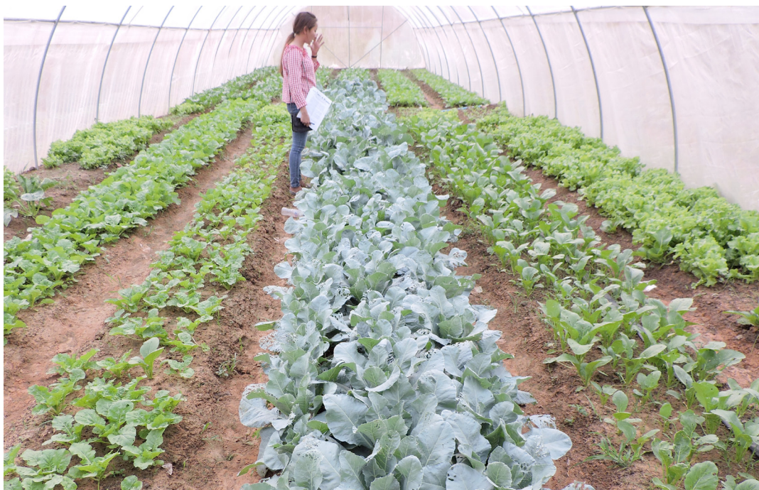
បច្ចេកទេសសាកល្បងកម្មវិធី អាចជួយពង្រីករដូវដាំដុះ កាត់បន្ថយផលខូចខាតក្នុងពេលមានគ្រោះធម្មជាតិ និងកាត់បន្ថយការប្រើប្រាស់ថ្នាំពុល, ក្រចេះ ខែមេសា ២០១៩

New horticultural techniques can help extend the growing season, minimise losses during natural disasters and reduce pesticide use, Kratie, April 2019