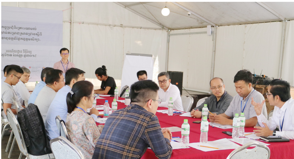
Consultative meeting for the project on Innovative Higher Education, Kirirom, September 2019

went on a research exchange to the Swiss Federal Institute for Vocational Education and Training.