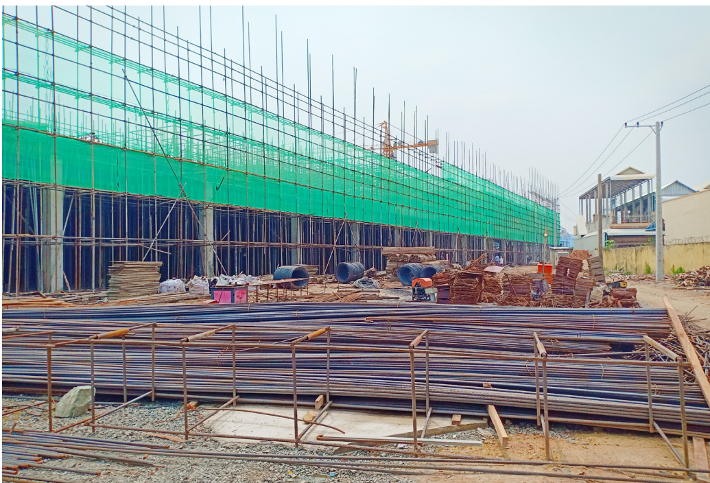
Construction industry is booming but should start incorporating more environmentally friendly features, Phnom Penh, June 2019

In collaboration with a master degree's student from the University of Bologna, Italy, a background paper on cybergovernance in Cambodia has been prepared for publication after a round of consultations and feedback from key local institutions.