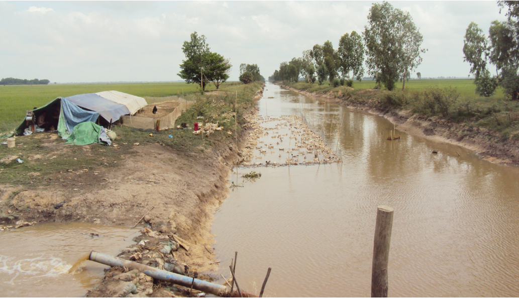
ផលិតផលកសិកម្មមានលទ្ធភាពធំណាស់សម្រាប់បង្កើនការនាំចេញ ដូច្នេះការអភិវឌ្ឍប្រព័ន្ធស្រោចស្រពនៅតែមានអាទិភាពខ្ពស់នៅកម្ពុជា, ខេត្តតាកែវ ខែកញ្ញា ២០១៩

With huge potential to increase exports of agricultural products, irrigation system development continues to be a high priority in Cambodia, Takeo, September 2019