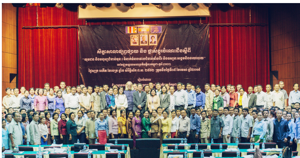
Dissemination workshop and knowledge sharing on Cambodia's young and older generation: Views on generational relations and key social and political issues, Phnom Penh, April 2019

findings and conclusions have been shared with a variety of key stakeholders working directly with youth in Cambodia. We also organised a large-scale workshop with almost 300 subnational officials in April 2019. We presented the findings to young people at a forum organised by Politkoffee, and a seminar convened by the Union of Youth Federations of Cambodia. There were also several small group presentations to the Ministry of Education, Youth and Sport, to civil society organisations through a lecture series organised by The Asia Foundation, and to development partners at brownbag meetings organised by the United Nations Resident Coordinator Office. Researchers also presented their work at regional and international conferences including the 10th Asian Conference on the Social Sciences in Tokyo on 20–22 May 2019, International Studies Association's Annual Convention in Toronto, Canada, on 27–30 March