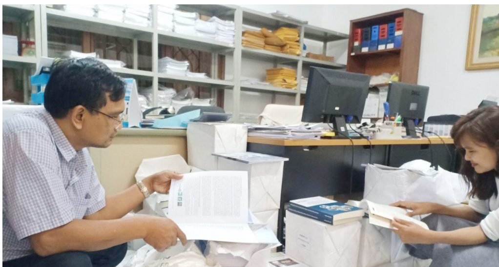
Publishing Unit staff controlling the quality of newly printed materials, CDRI, January 2020