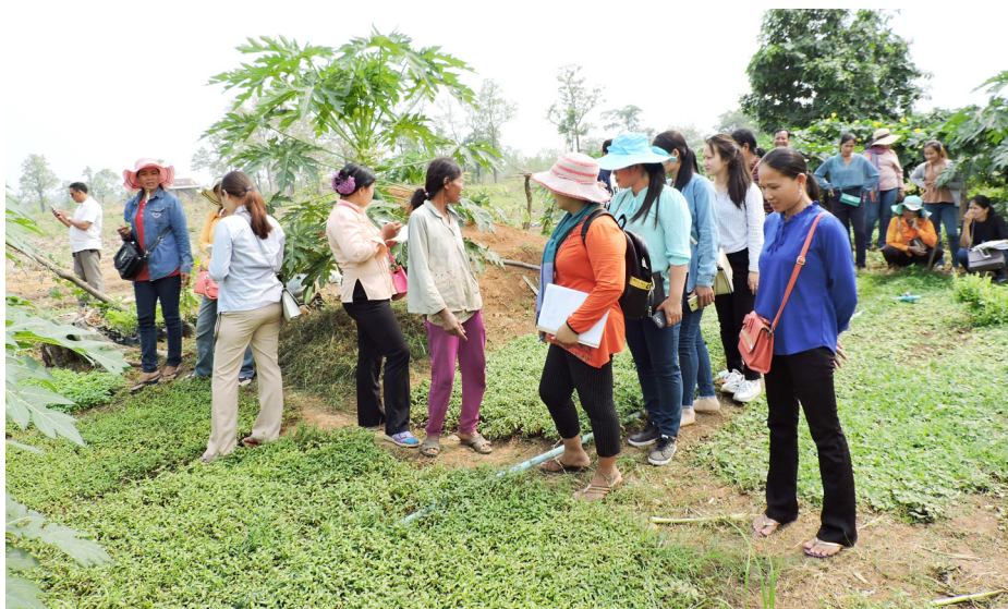
Fieldwork for the study on Empowering Women for Climate Resilience in Cambodia, Preah Vihear, March 2019