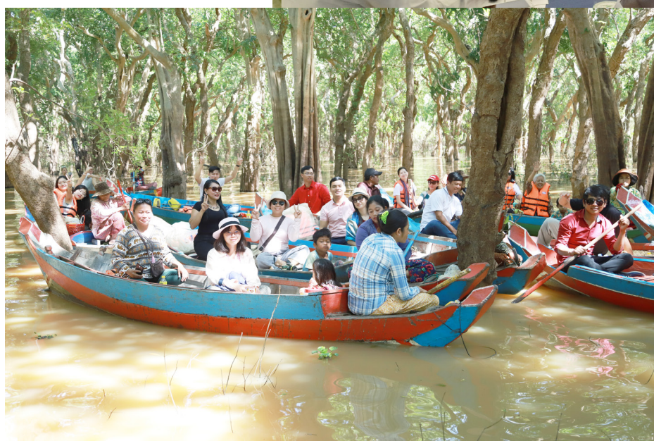
Meeting of senior staff to discuss ideas to make CDRI's campus more eco-friendly and digitally smart