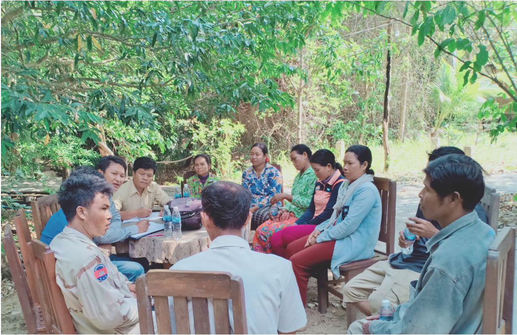
Meeting with a mixed group of villagers and local officials for the project Enhancing Research and Dialogue on Contract Farming in Mekong-Lancang Countries, Kampong Speu, March 2019

been strengthened and budgeting processes and accountability within research units improved. New projects in the pipeline will help secure another strong financial performance in 2020. Senior managers and researchers are actively engaged in writing funding proposals and searching for new funding resources. We have improved the visibility and dissemination of our research and strengthened financial management and reporting. The implementation of CDRI's Resource Mobilisation Action Plan enabled us to generate the target revenue of USD2.5 million.