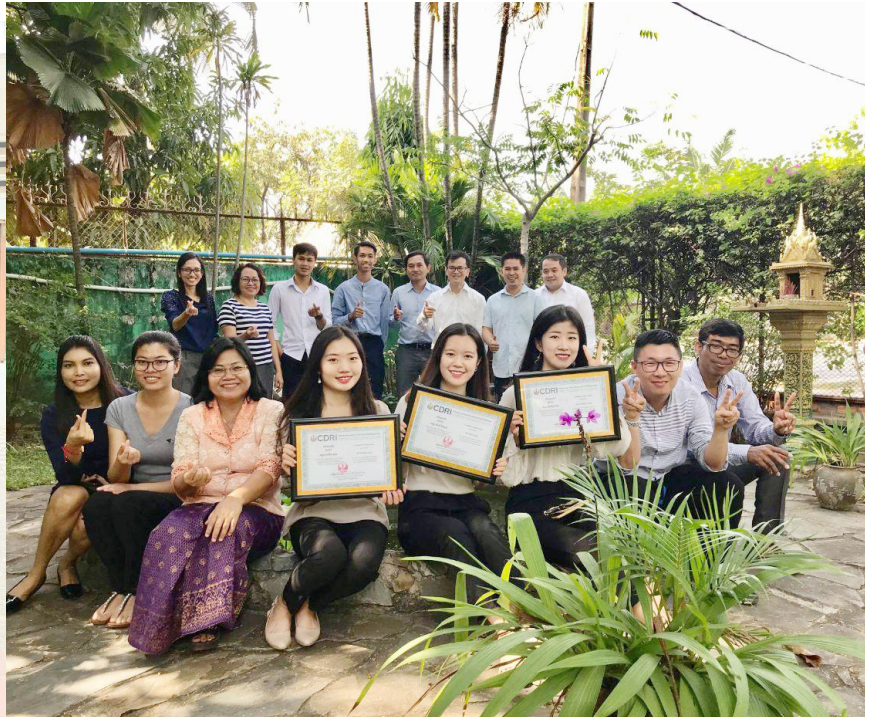
នាយកផ្នែកស្រាវជ្រាវស្តីទី នៃ CDRi ប្រគល់លិខិតបញ្ជាក់ការហាត់ការ ដល់និស្សិតអង់គ្លេស និងកូរ៉េ, CDRi ខែធ្នូ ២០១៩ CDRi's acting director of research awarding internship certificates to British and South Korean students, CDRi December 2019

អង្គការសហប្រជាជាតិស្តីពីច្បាប់សមុទ្រ។ ក្នុងនេះ វិទ្យាស្ថាន CDRi រំពឹងថានឹងដើរតួនាទីសំខាន់ ក្នុងកិច្ចពិភាក្សាពីច្បាប់ជាតិ ដើម្បីការពារធនធានសមុទ្រ និងបរិស្ថានរបស់ប្រទេសកម្ពុជា។