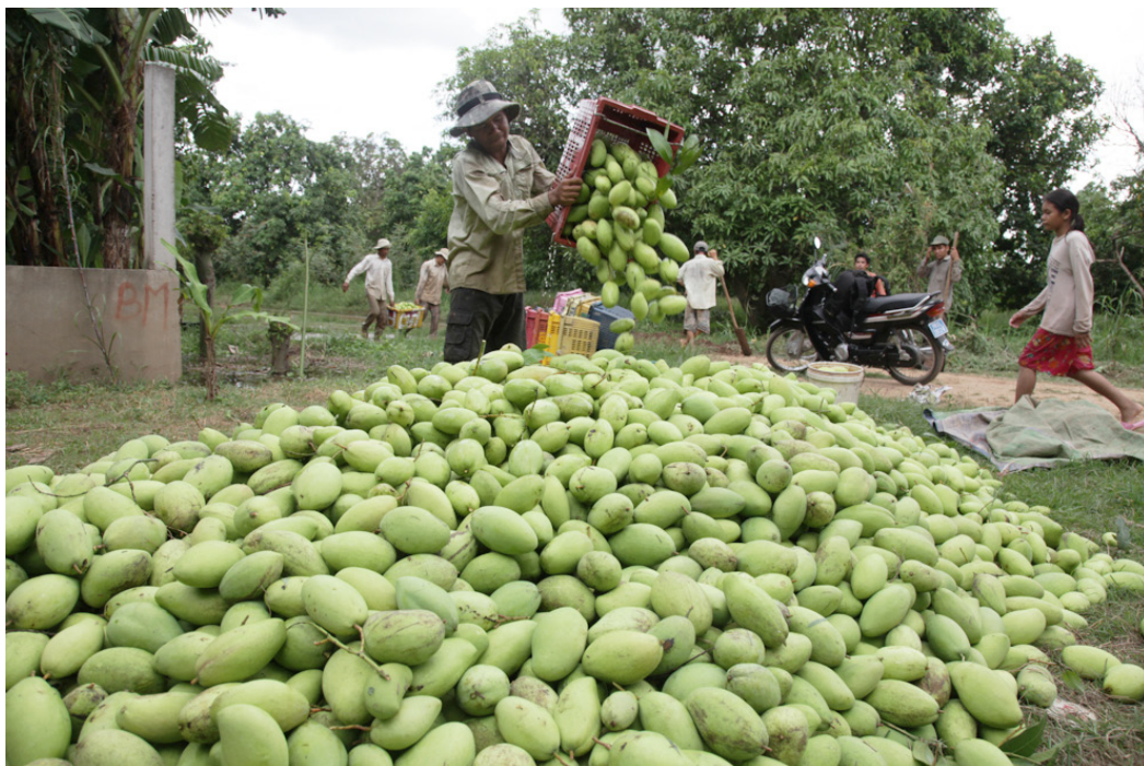
ស្វាយជាផ្លែឈើនាំចេញសំខាន់ជាងគេរបស់កម្ពុជា ដោយមានការបើកទីផ្សារថ្មីៗ នៅចិន និងកូរ៉េ នៅដើមឆ្នាំ២០២០ កណ្តាល ខែមេសា ២០១៩

Fresh mango is Cambodia's most important fruit export, with new market opportunities for Cambodian mangoes in China and South Korea opening in early 2020, Kandal, June 2019