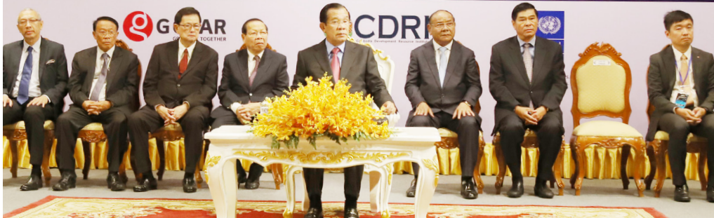
Samdech Akka Moha Sena Padei Techo Hun Sen, Prime Minister of the Kingdom of Cambodia, delivering the keynote address at the 13th Cambodia Outlook Conference, Phnom Penh, March 2019

partnership for smart and green cities, and governance for inclusive and sustainable cities.