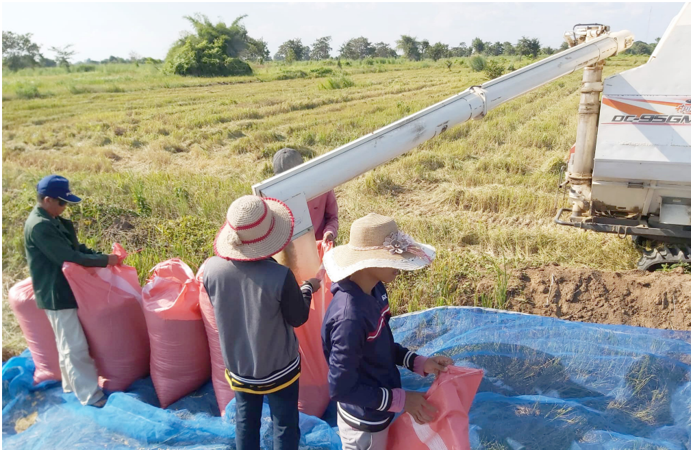
Agricultural mechanisation can reduce crop loss, increase crop yields and improve crop quality, all of which are important for export market expansion and diversification, Banteay Meanchey, May 2019