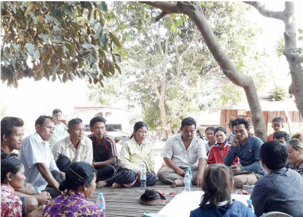
Focus group discussion for the study on Mekong-Lancang Cooperation: Cassava value chain analysis, Oddar Meanchey, March 2019

Economics. The project Cambodia in the Electronics and Electric Global Value Chain concluded with the publication of the findings in a CDRI working paper. For the project on Street Vendors, Youth Employment and Poverty Reduction , fieldwork has been done and data analysis and report writing are well underway.