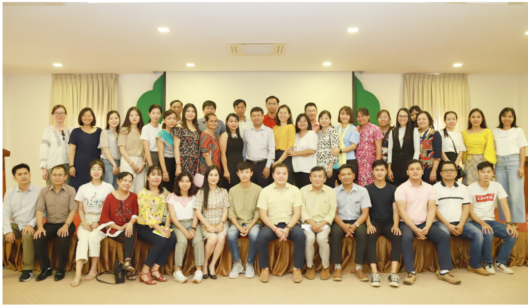
បុគ្គលិក CDRi នាពេលប្រជុំបូកសរុបលទ្ធផលប្រចាំឆ្នាំ, សៀមរាប ខែវិច្ឆិកា ២០១៩ CDRi staff at the staff retreat, Siem Reap, November 2019