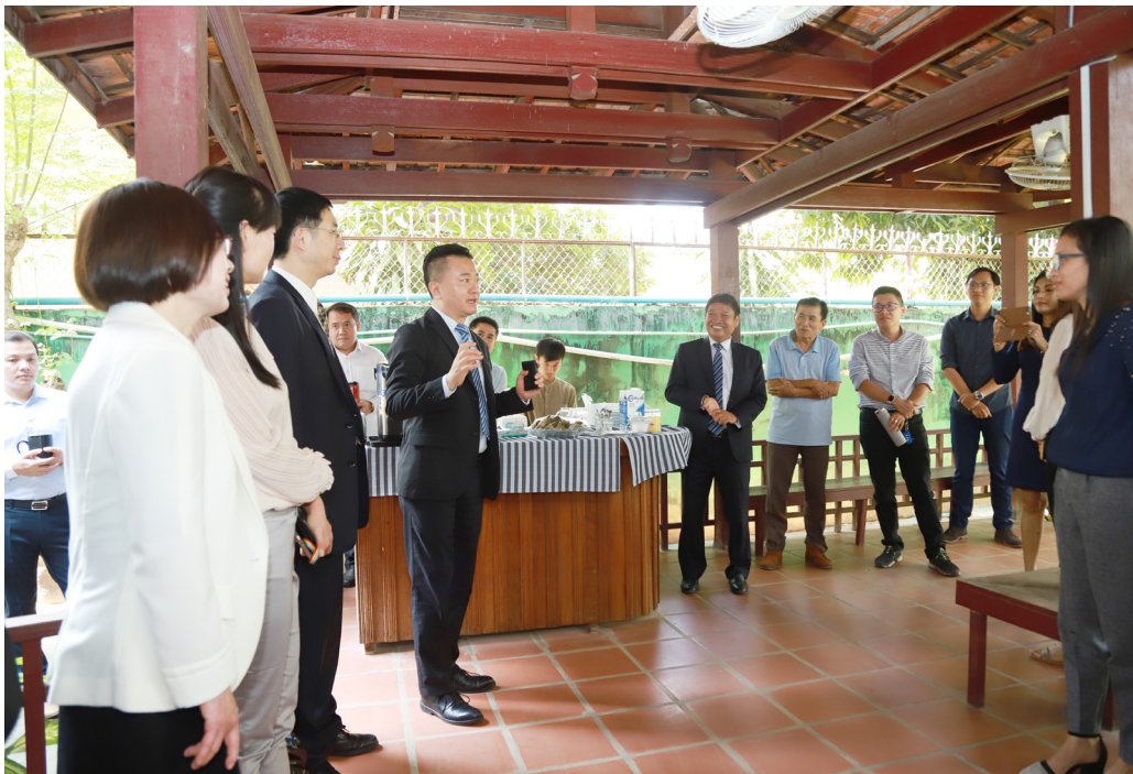
Delegates from the Foreign Affairs Office of the People's Government of Yunnan Province, China during their visit to sign the MOU marking an academic partnership between the two institutions, CDRI, December 2019

Central Institute for Economic Management, Vietnam Centre for Analysis and Forecasting, Vietnam Academy of Social Sciences Centre for Economic and Social Development, Myanmar Development Resource Institute Economic Research Institute for Industry and Trade at the Ministry of Industry and Commerce, Laos Faculty of Management and Economics, Kunming University of Science and Technology, Yunnan, China Institute of Policy and Strategy for Agriculture and Rural Development, Vietnam Kasetsart University, Thailand National Agriculture and Forestry Research Institute, Laos Thailand Development Research Institute Vietnam Institute of Economics, Vietnam Academy of Social Sciences