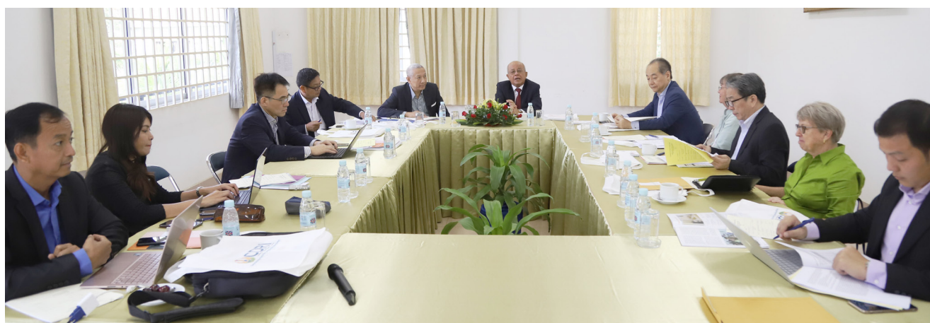
Full board meeting of CDRI's Board of Directors, CDRI, March 2019